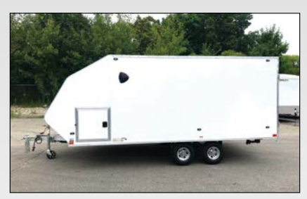
This 14-foot side-by-side model shown here has twin axles, aluminum wheels and Flo-thru yents.