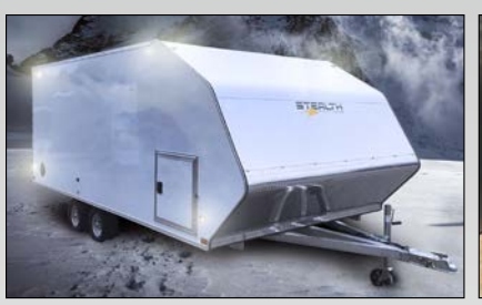
Clean, attractive lines and aerodynamic shape of the side-by-side Glacier make for easy towing.